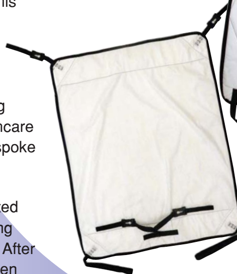
CA500PS Toilet ▲