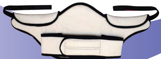
CA800PS Standaid ▼

Care-ability Healthcare Ltd, Phoenix House, Pattinson Industrial Estate, Washington, Tyne & Wear, NE38 8QE, UK