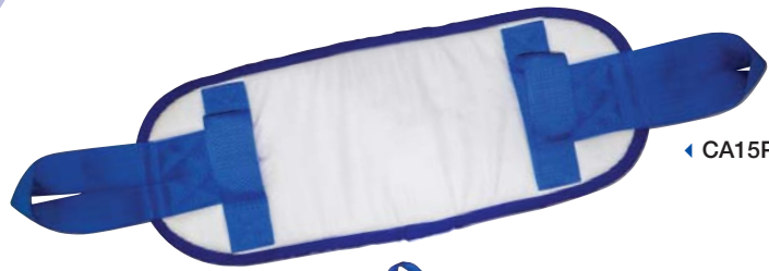
◀ CA15PS Leg Sling