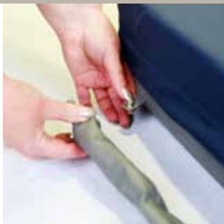
Detach the pipes from the foot end of the mattress.