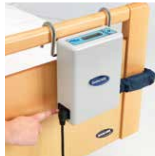
Simply switch on, no additional adjustments required.