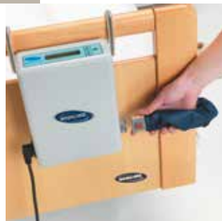
Fit pipes to the Active pump.