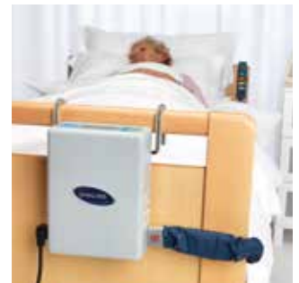
The patient is now lying on an alternating surface.